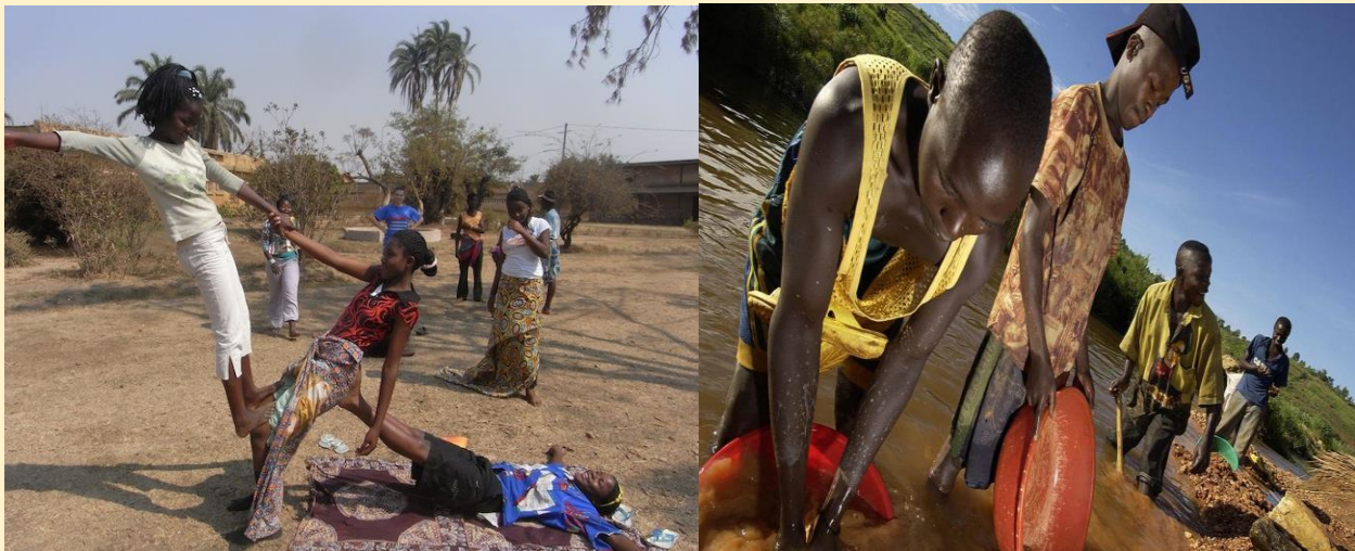
Sharing Knowledge, Learning together

Our stakeholder engagement services create dialogue between local communities and external stakeholders. We elucidate local context, enabling organisations to work safely and effectively, understanding the social impact of their operations