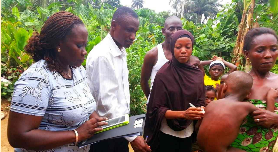
Research and Analytics For a brighter World

Research and analysis is about providing our clients with the evidence they need to make better-informed and more confident decisions. Our research reveals local perceptions and realities in hard to access contexts and communities.