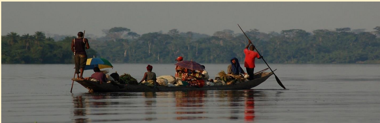
Innovative solution for sustainable future

Our capacity development services support by providing highly-skilled people with valuable knowledge and expertise to rebuild the country's systems, institutions and governance structures. We work with partner organisations to help them ensure effective use of their resources in order to best achieve their objectives.